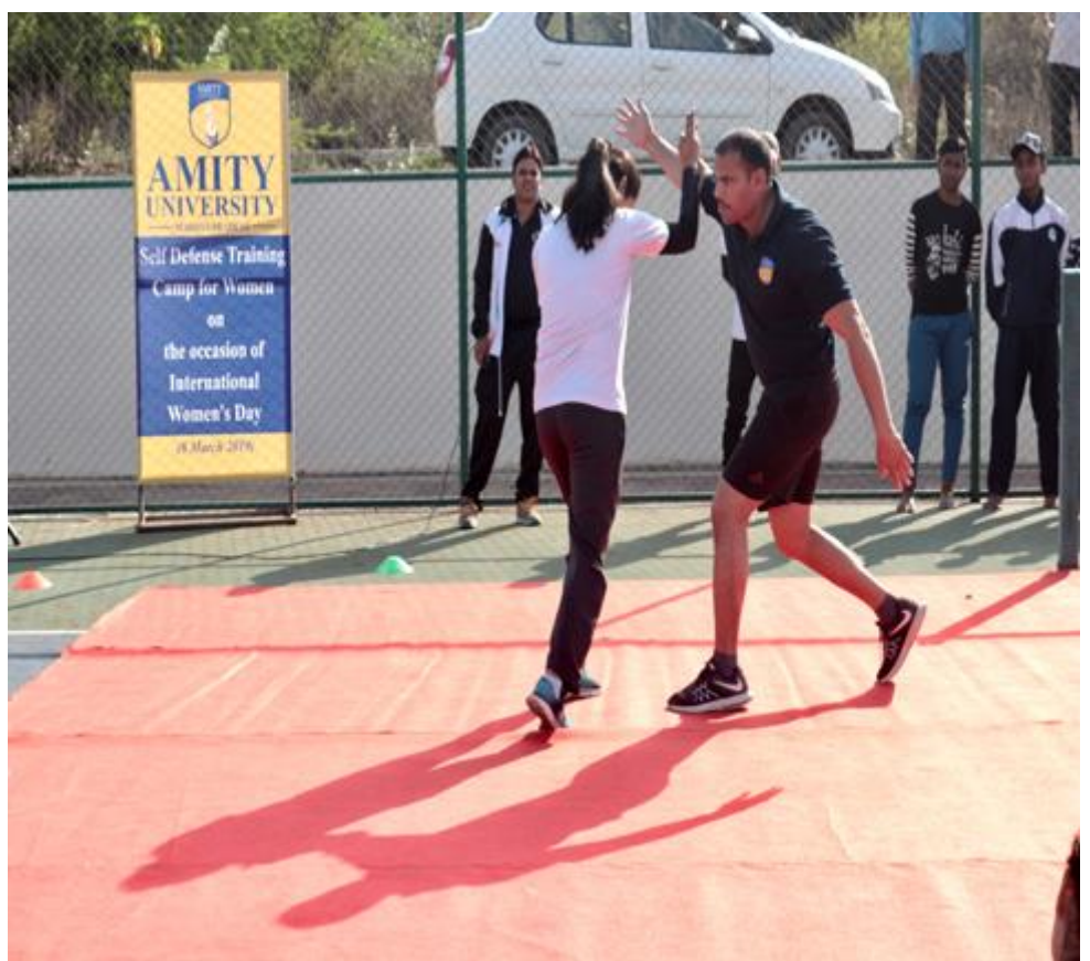
Self Defence Techniques giving by Trainer