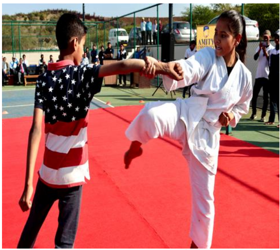
Participants Demonstrating Martial Arts