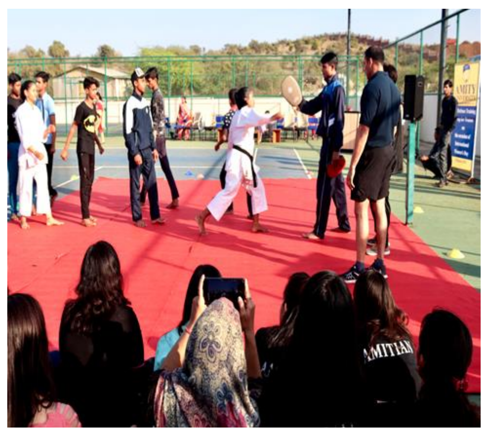
Participants Demonstrating Martial Arts